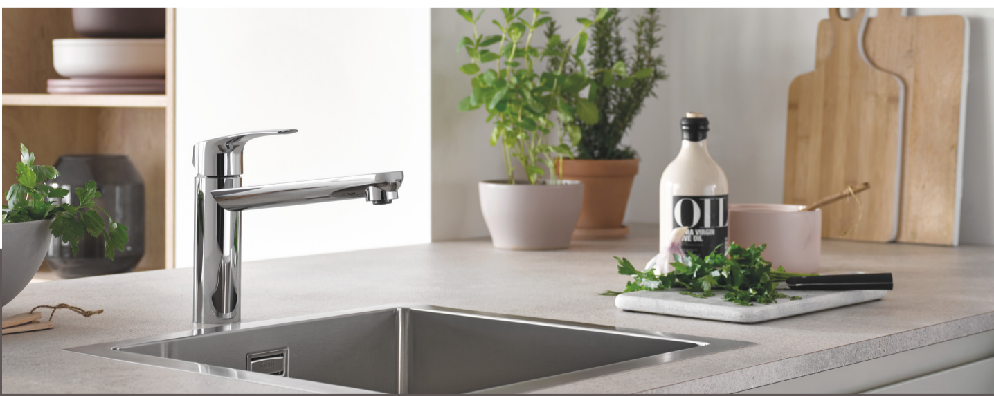
GROHE Eurosmart medium spout, in Chrome

To complete the 60 centimeters surrounding the kitchen faucet by one single source, GROHE offers matching sinks and waste systems. GROHE Eurosmart kitchen faucets are perfectly complemented in design and function by the stainless steel sink lines K200 and K400 and undermount solutions. For customers who prefer a stylish dark sink, both sink series are also available as composite sinks in granite gray and granite black.