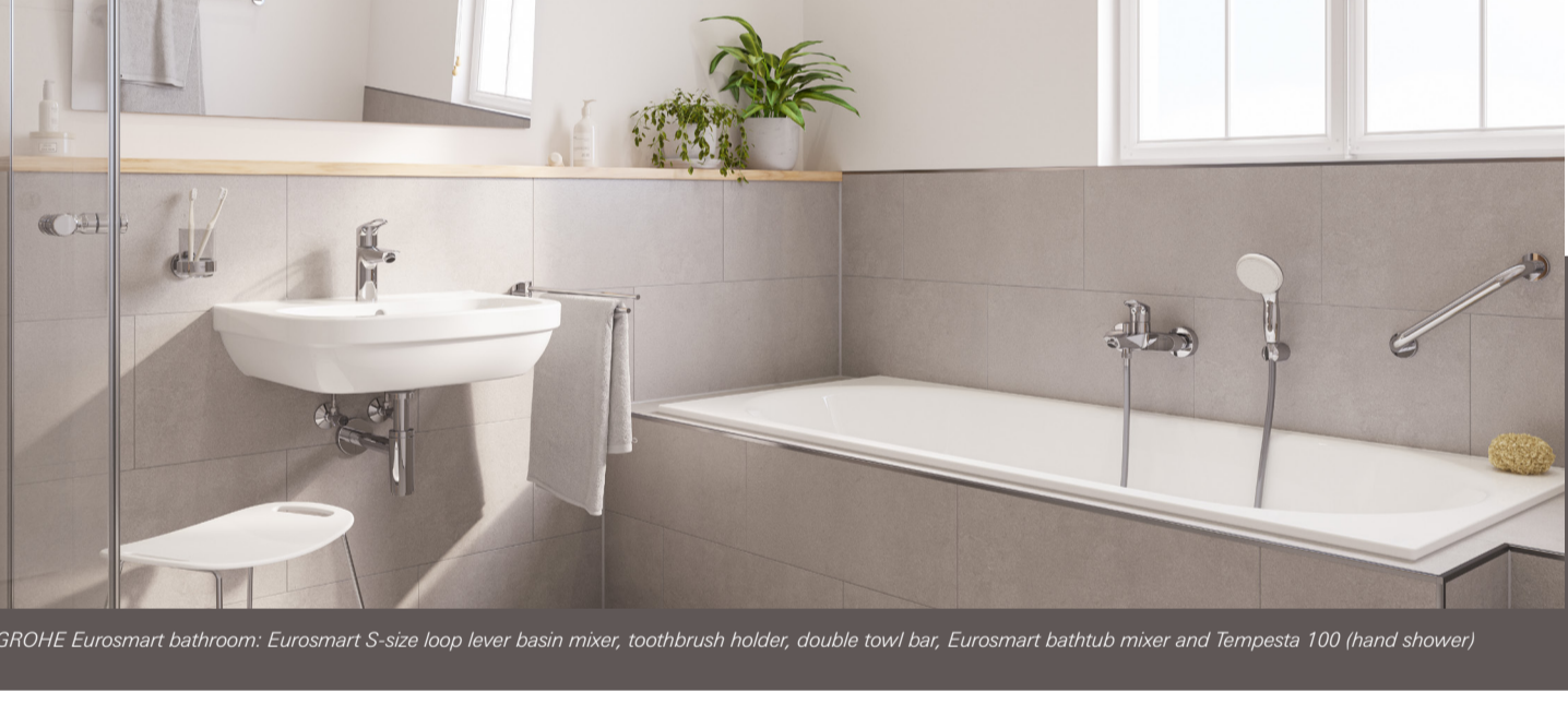
GROHE Eurosmart bathroom: Eurosmart S-size loop lever basin mixer, toothbrush holder, double towel bar, Eurosmart bathtub mixer and Tempesta 100 (hand shower)

The GROHE Eurosmart product portfolio offers for convenient and modern bathroom planning in a few simple steps. In line with the perfect match philosophy GROHE offers with Euro a matching ceramic range to the Eurosmart bathroom faucets which enable professionals to provide complete bathroom solutions from one single source: From the wash basin to the toilet, the bidet and the urinal – the range perfectly harmonizes with the faucets for the wash basin as well as for the bath tub or shower in form and function to create holistic bathroom concepts. Furthermore the GROHE Essential accessoires can round the coordinated Eurosmart bathroom up.