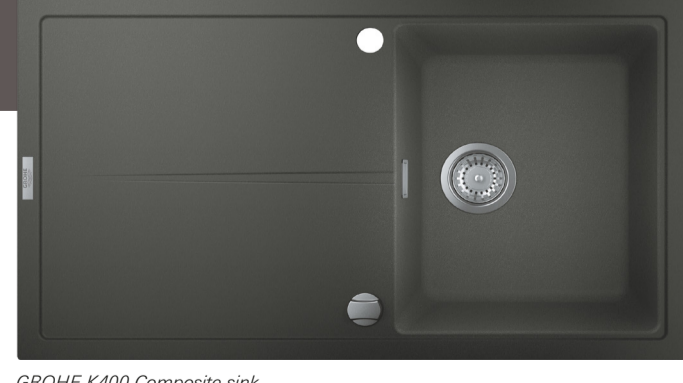
GROHE K400 Composite sink

You can download high-resolution images of GROHE Eurosmart for kitchen and bathroom via the following link .