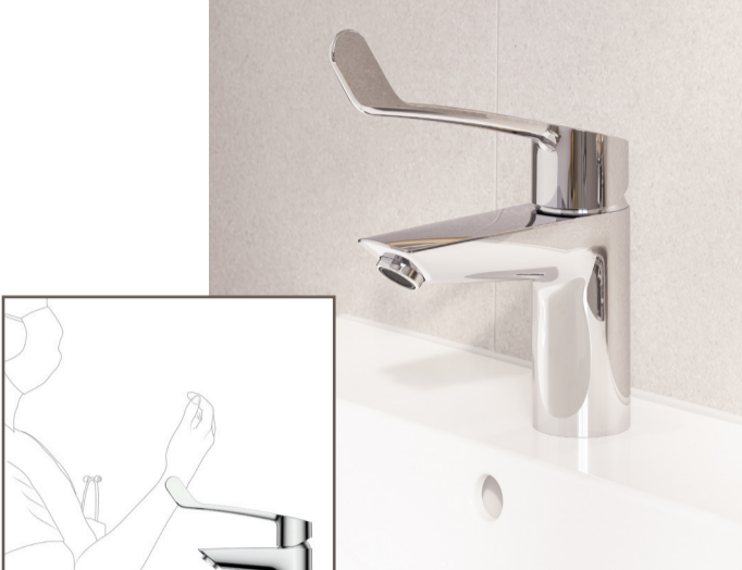
GROHE Eurosmart with extra-long lever