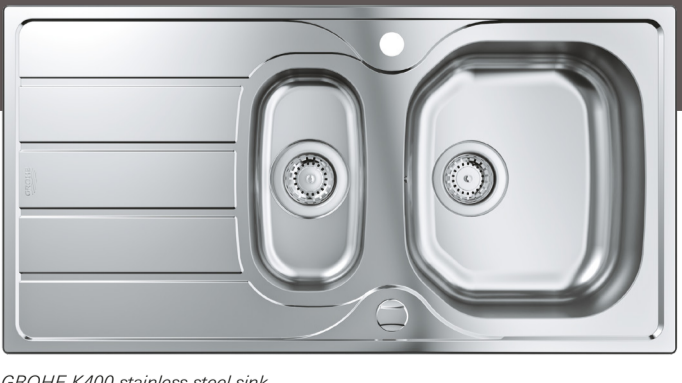
GROHE K400 stainless steel sink