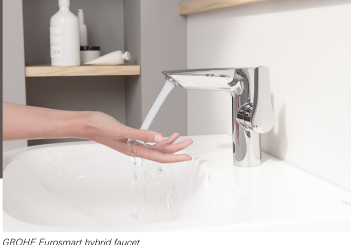
GROHE Eurosmart hybrid faucet

The Eurosmart hybrid variant offers additional advantages when it comes to comfort and hygiene. It combines the advantages of a manual and a touchless faucet. Users can decide whether they want to use the manual lever or use touchless technology by activating the water flow via the integrated sensor. By using the infrared sensor control the faucet is only using cool water supply which is optimal for washing hands while saving valuable energy.