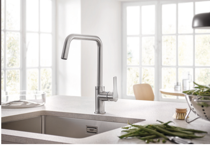
GROHE Eurosmart high U-spout, in SuperSteel

The Eurosmart high spout faucets comes in a U- or C-shape as well as wall-mounted and are a perfect fit for bigger kitchen spaces. The size offers optimal comfort for the customer when filling in larger pots. For all variants installers and planners can offer customers further choices with two different finishes: a brilliant Chrome and a matte SuperSteel , both with an easy to clean and scratch-resistant surface.