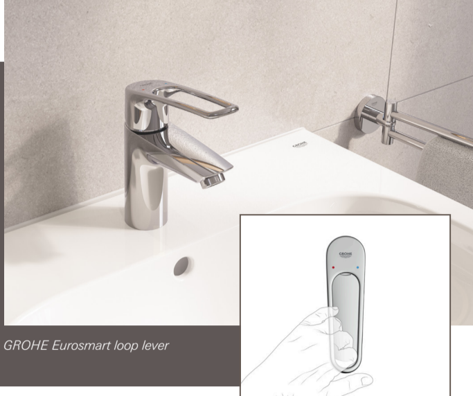
GROHE Eurosmart loop lever

The Eurosmart loop lever , for example, simplifies gripping thanks to the cut-out center. This makes the product variant ideal for people with limited motor skills and for care homes, allowing everyone to live as independently as possible for as long as possible.