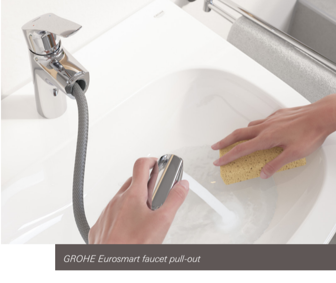
GROHE Eurosmart faucet pull-out

For extra comfort the pull-out spout variant offers full flexibility – perfect for washing hair or cleaning the basin.