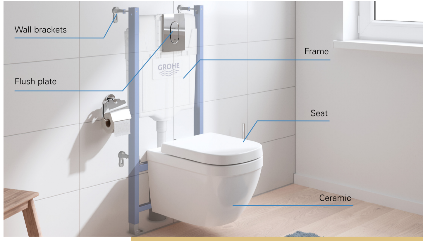
SOLIDO ALL IN ONE: Euro Ceramic