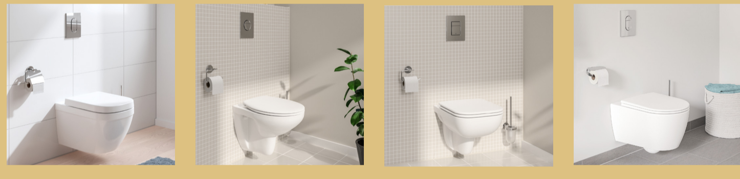
Euro Bau Start Edge Essence