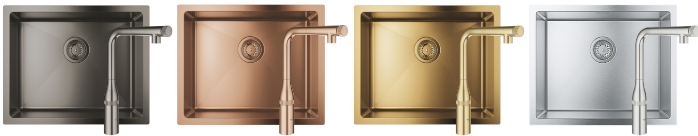
The perfect match of GROHE sink and GROHE Accent SmartControl kitchen faucet, in "Brushed Hard Graphite", "Brushed Warm Sunset", "Brushed Cool Sunrise", and "SuperSteel".

For a simple and harmonic kitchen update, GROHE's faucets are easy to install and to integrate in every kitchen set-up. The hassle-free installation of SmartControl kitchen faucets saves essential work time for installers. Furthermore, their perfect match with GROHE's kitchen sinks creates a complete and harmonious overall kitchen design. Complementing the SmartControl range in form and function, GROHE offers a selection of undermounted kitchen sinks (like K200, K400, K500 and K700 ranges), which are available in stainless steel as well as composite variants.