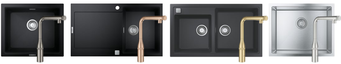
The perfect match of GROHE sinks and GROHE Essence SmartControl kitchen faucet, in "Brushed Hard Graphite", "Brushed Warm Sunset", "Brushed Cool Sunrise", and "SuperSteel".

For a simple and harmonic kitchen update, GROHE's faucets are easy to install and to integrate in every kitchen set-up. The hassle-free installation of SmartControl kitchen faucets saves essential work time for installers. Furthermore, their perfect match with GROHE's kitchen sinks creates a complete and harmonious overall kitchen design. Complementing the SmartControl range in form and function, GROHE offers a selection of undermounted kitchen sinks (like K200, K400, K500 and K700 ranges), which are available in stainless steel as well as composite variants.